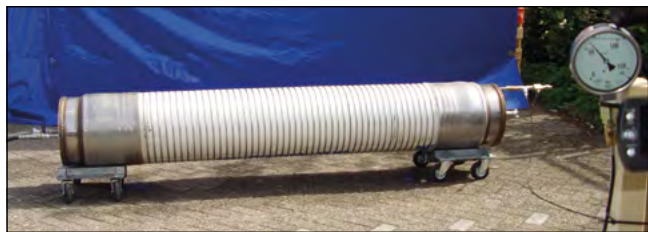
Ambient burst test on prototype Multi-LNG White 16”

** Performed at cryogenic conditions and at maximum allowable flow speed of 14 m/s