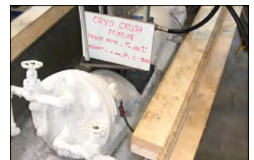
8" Multi-LNG White STS crushed with external loads up to 160 kN. Internal hose pressure of 6 bar. Done both ambient and cryogenic without any leakage.