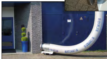
Bending of a Multi-LNG White 16”