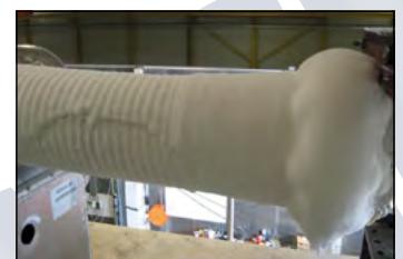
Hose filled with LIN during 9 weeks.